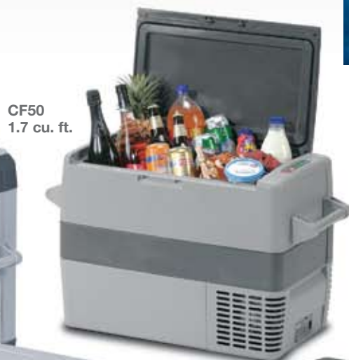
CF50 1.7 cu. ft.