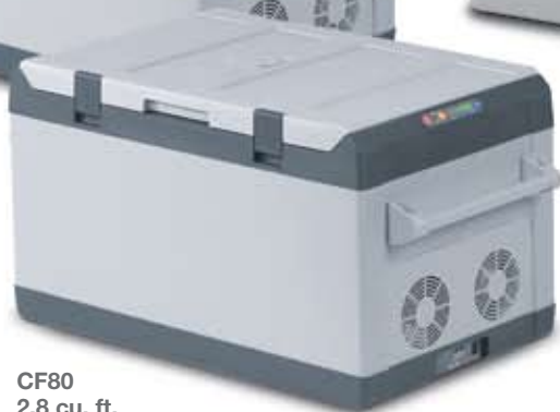
CF80 2.8 cu. ft.