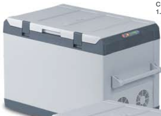
CF110 3.77 cu. ft.