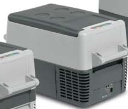
CF35 1.1 cu. ft.