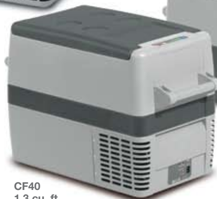
CF40 1.3 cu. ft.