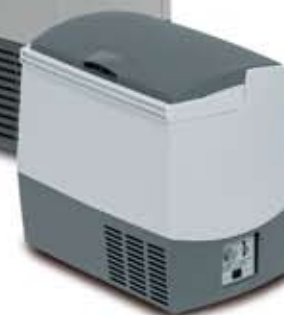
CF18 .7 cu. ft.