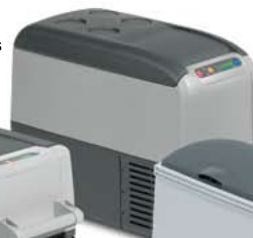
CF25 .9 cu. ft.