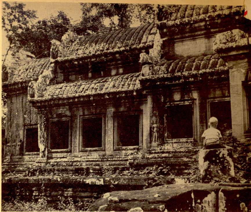
SCOTT SMITH AT ANGKOR WAT, CAMBODIA

couple to embark on such an adventure with three small children - 7, 5 and 9 months. The truth is, if you can take small children anywhere, you can take them around the world in a trailer. Kids, we discovered, are better at taking things as they come than grown-ups, and some ways, small children adapt better than older ones. In point of health, our three were better off that year than their cousins at home. And if we had one special thing in our favor, as we covered 30,000 miles and 31 countries, it was having our children with us. They made friends for us everywhere we went. They attracted affection, and they returned it. They were undismayed by strange smells or bizarre surroundings. They prevented too tight a schedule of 'places of interest'. And unless we had had to chase them through the flower beds, how could we have lain on the ground to see the Taj Mahal through a garden of flowers?"