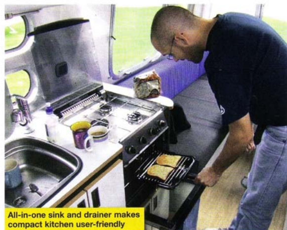
All-in-one sink and drainer makes compact kitchen user-friendly