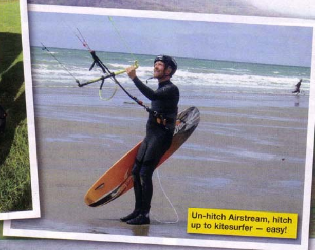
Un-hitch Airstream, hitch up to kitesurfer — easy!