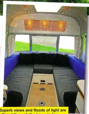
Superb views and floods of light are offered through the bay window

Full-timers, site wardens, and anyone who spends more nights in their van than they do at home. Also caravanners looking for a van to hang on to for the rest of their lives.