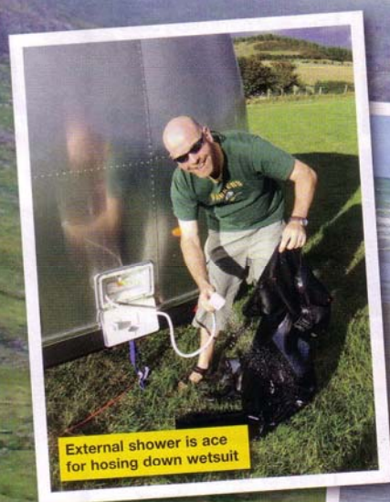
External shower is ace for hosing down wetsuit

But what the heck. The gutsy Nissan makes short work of the sleek, smooth stunner in tow. A daft BMW driver thinks he's going to overtake us on a slip road joining the Warwick bypass, but flooring the Navara we leave him standing. Of all the many caravans I have