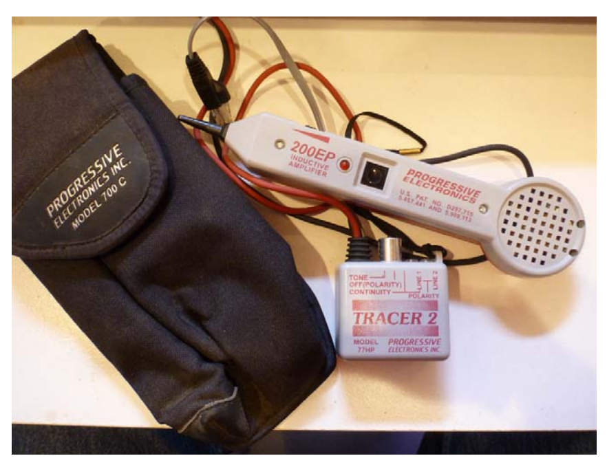
A typical signal tracer set consisting of a tone generator/continuity tester (small box marked "Tracer 2") and signal tracer amplifier/'banana' (marked 200EP.)

Electronics technicians have used them for years to trace out wiring inside a variety of audio, TV and radio gear. Telephone technicians also use them to find open, shorted and correct pairs of wires for phone, intercom and network applications. Once and obscure item buried in specialty tool catalogs they now may be found at many home improvement stores, electronics suppliers like Fry's, as well as through Amazon and eBay. There are many different manufacturers of these units – I have three different makes/models from old "Bell System" to the Progressive Electronics model shown here.