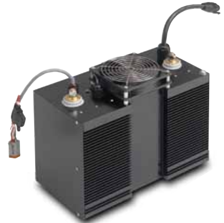
Inverter/charger model #4220507 shown