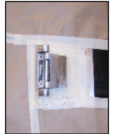
Figure 2: mask the door hinge