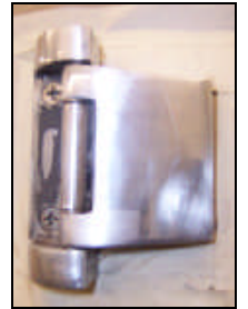
Figure 3: polish with Met-All.