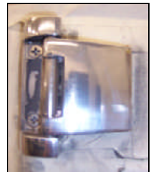
Figure 4: shine handle